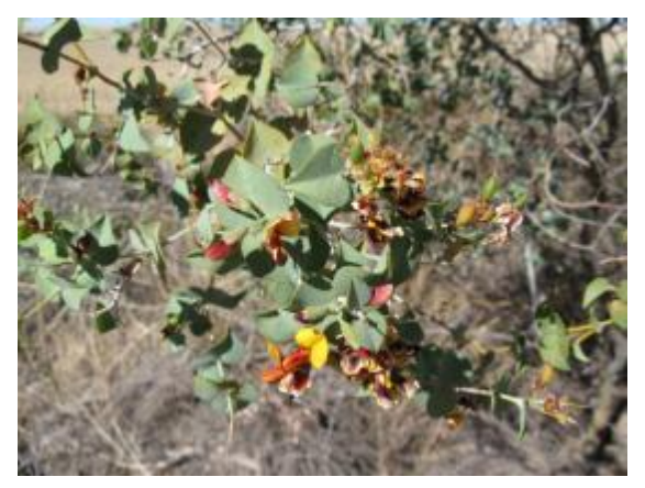
Image 4 - Prickly poison (Gastrolobium spinosum) is native to Western Australia